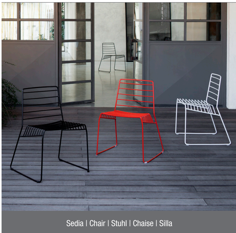
Sedia | Chair | Stuhl | Chaise | Silla