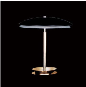
Table lamp. Blank brassframe. Black opal glass bowl,6 mm thick, internally sandblasted. Lower diffuser in white, frosted glass.